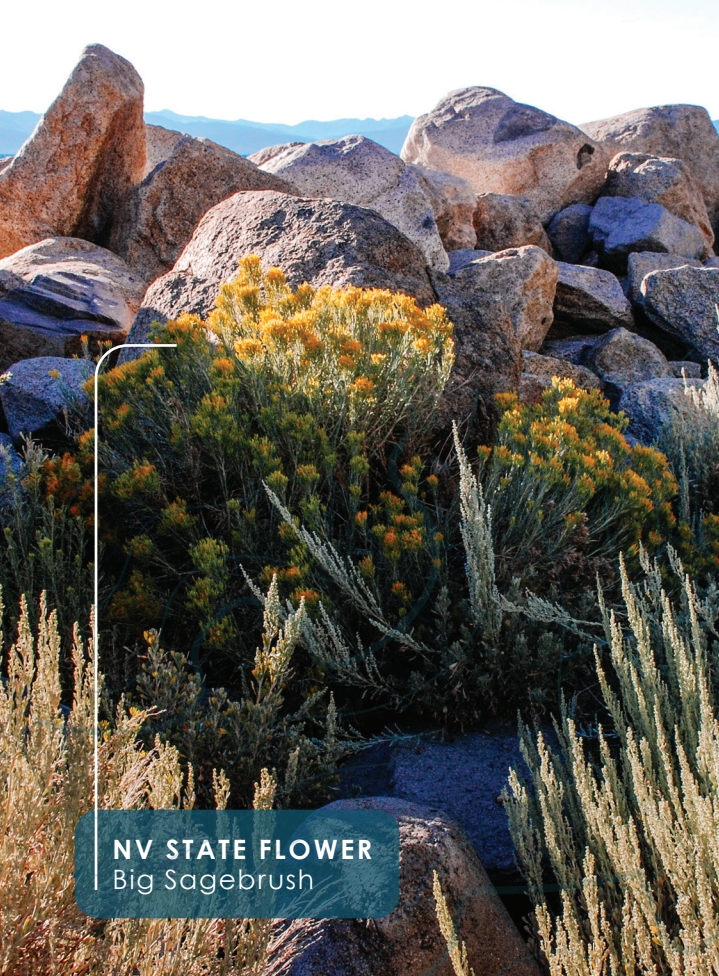
NV STATE FLOWER Big Sagebrush